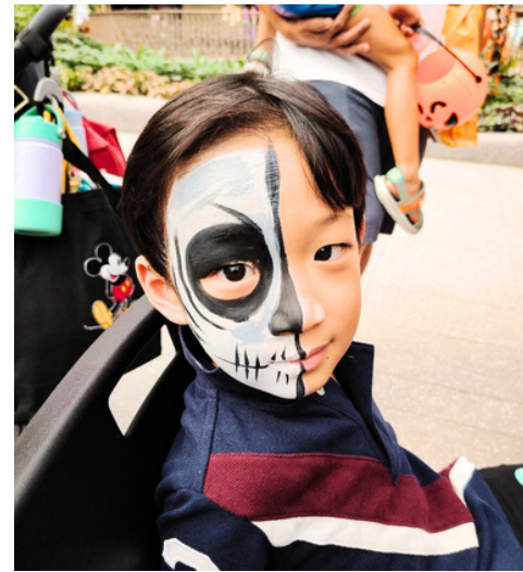
RESORT WORLD SENTOSA HALLOWEEN