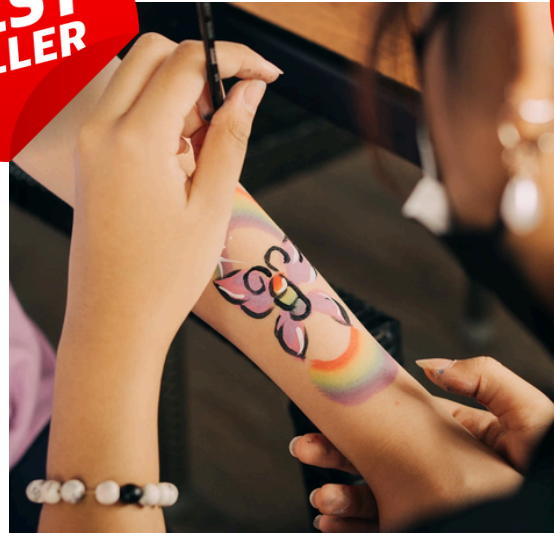
Face & Hand Painting