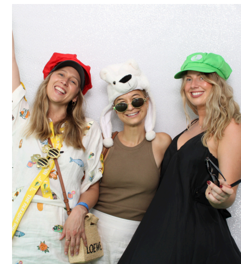
F1 NIGHT RACE