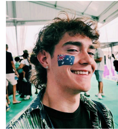
HSBC RUGBY SVNS