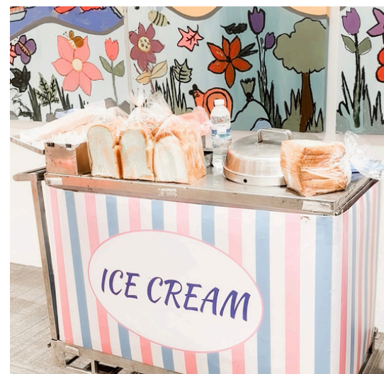
Traditional Ice Cream