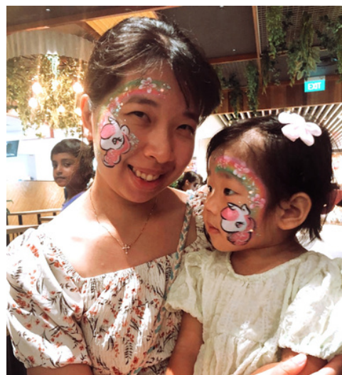
GUZMAN Y GOMEZ PATRON ENGAGEMENT