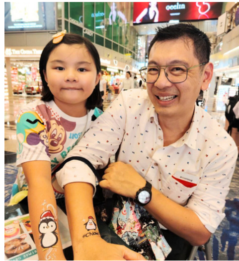
CHANGI AIRPORT CHRISTMAS & OLYMPICS

Over 5,000 events. Hundreds of brands. One consistent result: families who leave happy.