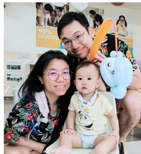
LITTLE SKOOL HOUSE OPEN HOUSE